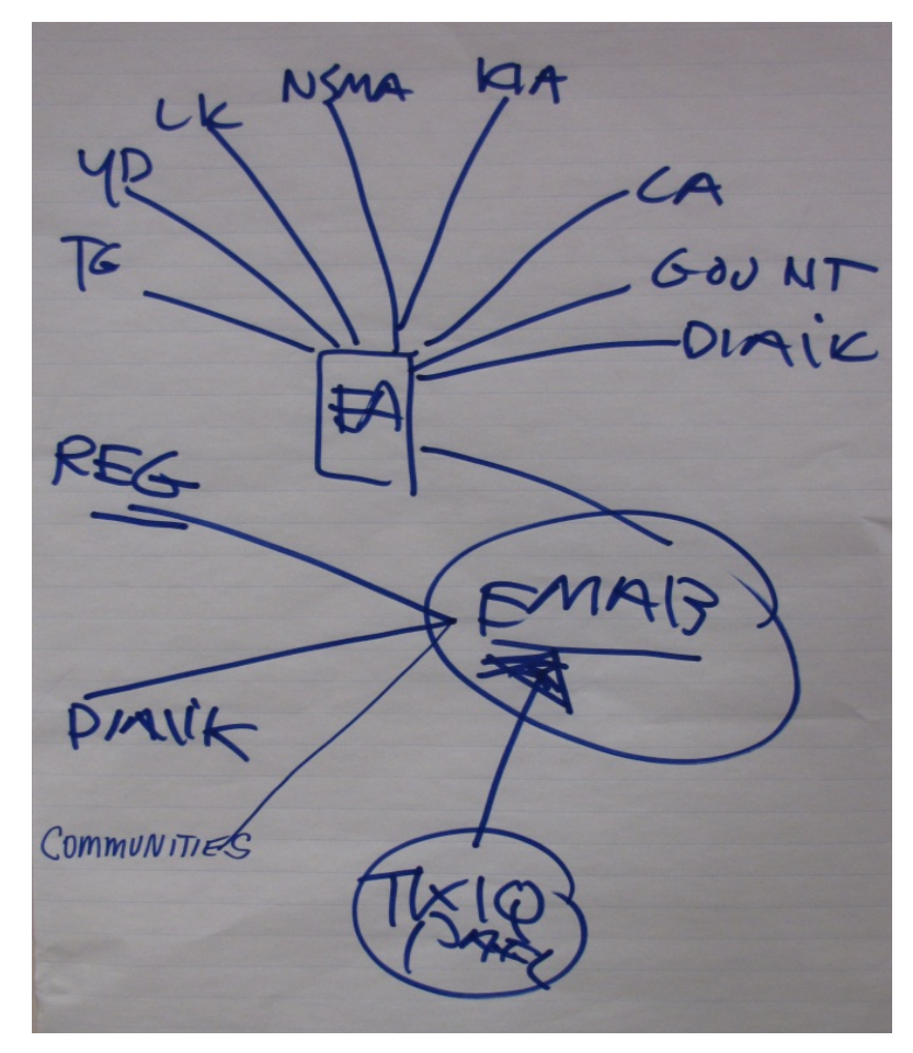
Figure 1: Schematic of Framework for TK/IQ Panel Inputs

This Interim Report provides a summary of session activities, including immediate recommendations for action to be considered by EMAB and notes that were posted during the session. Discussion notes should not be construed as recommendations.