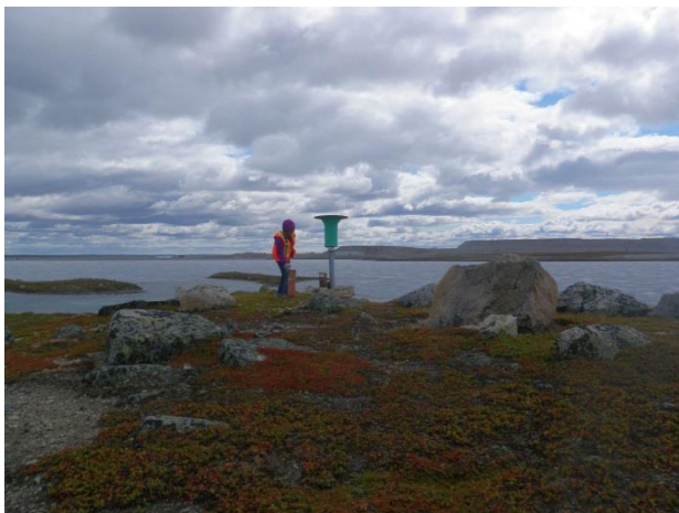
Dust Gauge Site 5 in the Summer