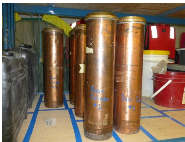
Dust Gauge Tubes in the Field Lab