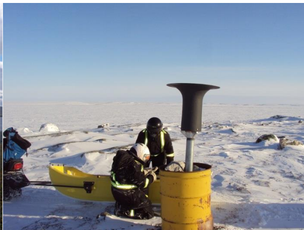
Dust Gauge Site 7 in the Winter